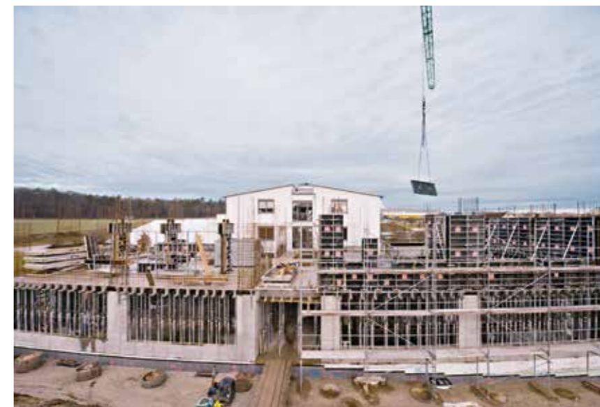
▶ RASTO: The ideal formwork for smaller and medium-size projects, particularly in the housing sector.

▶ RASTO-TAKKO is a frame panel formwork that can – up to a panel width of 90 cm – be used by hand without a crane or as large-area units with a crane.