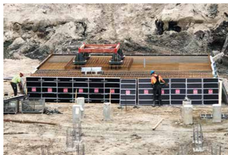
▶ Craneless forming possible due to low weight of basic RASTO and TAKKO panels