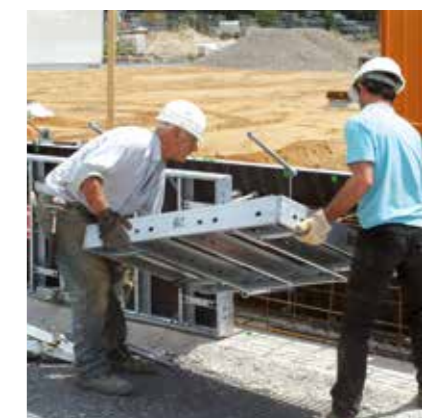
▶ RASTO-TAKKO application as a foundation formwork