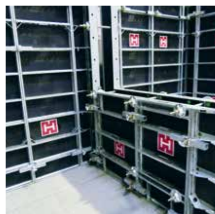
▶ Highly versatile wall formwork system with the same connection elements for every project size