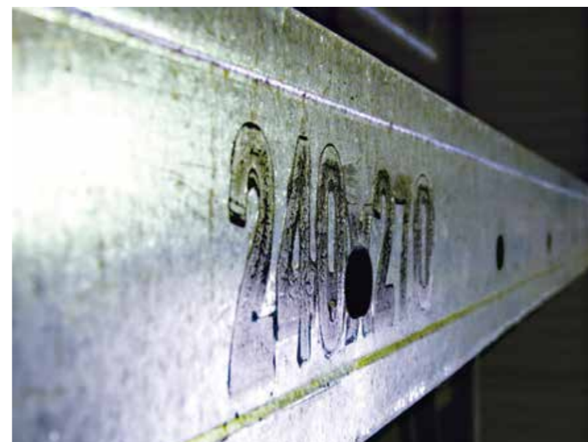
▶ Longer service life due to the robust, galvanized steel frame profile with 12 cm thickness